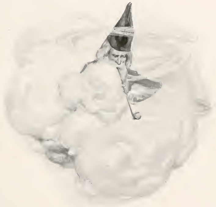
The little man disappeared in a cloud of smoke. (P. 236.)

“As the mother of a man who owns a glass factory,” said she, “I shall be a degree above my